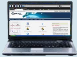
Web Based Application