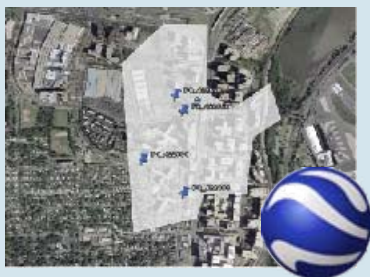
GeoFence - Polygons

AssetView is a fully featured web based application providing online provisioning, unit management, web based alert configurations, and reports. AssetView is readily available to any user with internet access and is a single point of access to account and asset information.