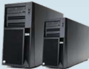
Server to Server